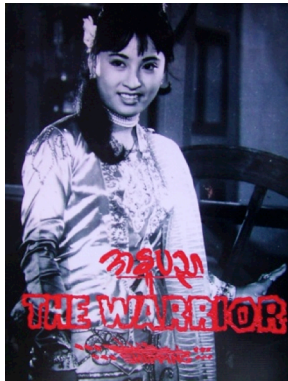
«The Warrior» 2012, Acrylic on Vinyl, 122cm X 92cm