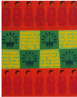
“Dancing Peacock 3”, 2014 Acrylic on Canvas, 76cm X 62cm