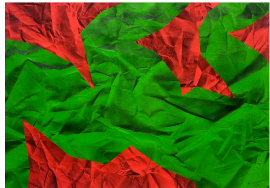
«Ordinary People no. 18”, 2014, Paper Collage, 60cm X 45cm