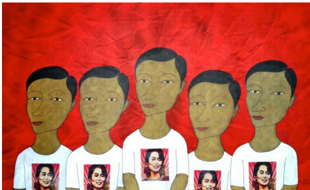
«Lost of Identity no.26», 2014, Acrylic on Canvas, 92cm X 157cm