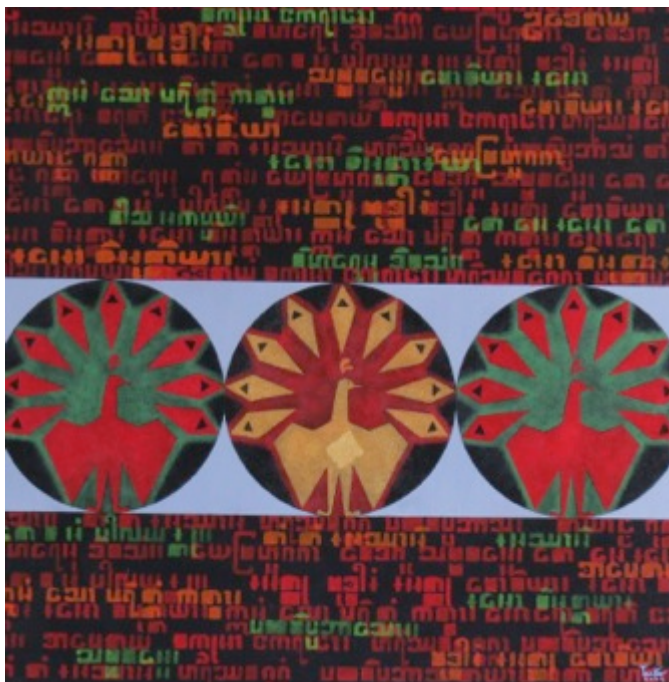
Tartie- Dancing Peacock 1, 2014, Acrylic on Canvas, 62cm X 62cm