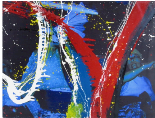
«Two Spirit Medium”, 2008, Acrylic & Enamel on Vinyl, 92cm X 122cm