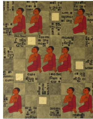
“Lovely Kindness 3”, 2014 Acrylic on Canvas, 76cm X 62cm